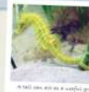
A Shiny Seahorse in a water tank

The Seahorse Trust is a Registered Charity, no. 1086027.