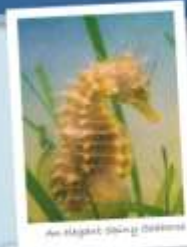
An elegant Shiny Seahorse

Both species of British Seahorse can be found from the Shetland Isles down the west coast of the UK, around Ireland and along the south coast of England. There have also been sightings of Seahorses on the east coast and out in the North Sea.