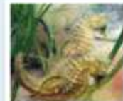
Shiny Seahorses in the glass

Seahorses are fish. They live in water, breath through gills and have a swim bladder. However, they do not have caudal fins and have a long snake-like tail.