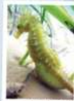
A pregnant male

The Seahorse is the only creature where the male has a true reversed pregnancy. The female transfers her eggs to the male which he self fertilises in his pouch. They receive everything they need in the pouch from oxygen to food. Gestation time varies from 2 to 4 weeks and giving birth can be a long process with contractions lasting up to 12 hours.