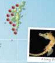
A Shiny Pony

Both species of British Seahorse can be found from the Shetland Isles down the west coast of the UK, around Ireland and along the south coast of England. There have also been sightings of Seahorses on the east coast and out in the North Sea.